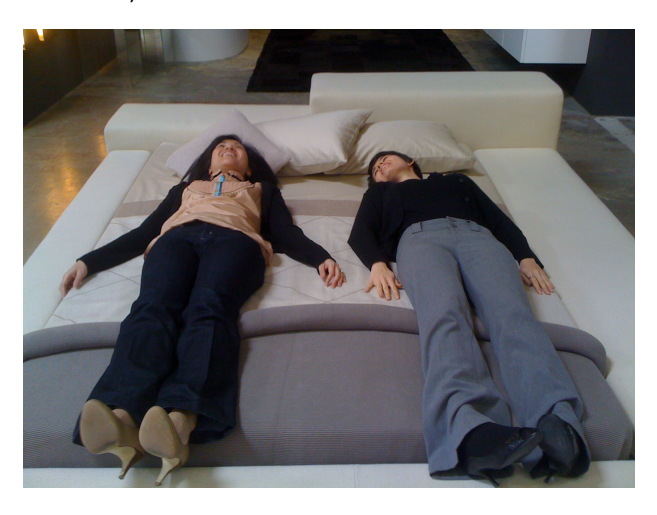
March 12, 2011

DZINE is proud to now represent the mattress manufacturer Somnium. What sets Somnium apart from their competitors is their OmniFlex springs, designed to increase comfort through better support.